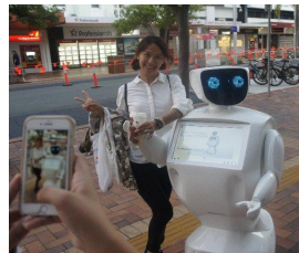
Promobot doing selfie @ Commonwealth Games