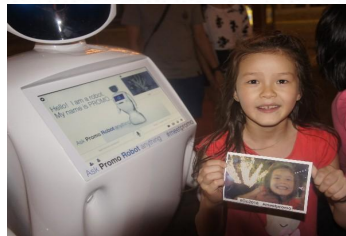
Promobot stopping to print photo for new friend