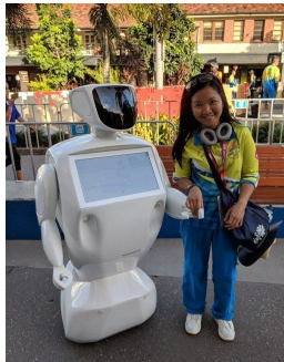
Promobot loves meeting with new friends at Commonwealth Games